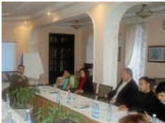
CRRC's PAC training delivered to Oxfam, ERC and their partner organizations

CRRC-Azerbaijan has completed the development of a unique training package Policy Analysis and Communication (PAC) — the first training module in Azerbaijan available in Azerbaijani, Russian and English and featuring an online distance learning component. The curriculum builds on eight interactive sessions and various hands-on exercises, specifically tailored to equip analysts in the South Caucasus with the essential skills to handle policy analysis confidently and effectively.