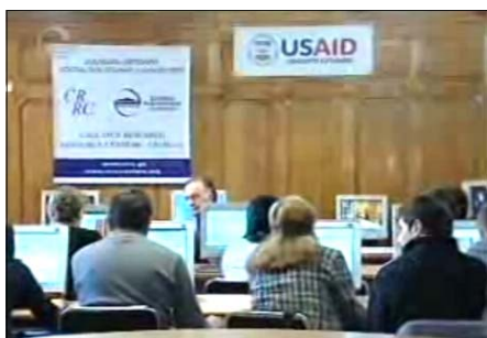
Event on Imedi TV channel

IREX in the framework of IATP program in cooperation with Tbilisi City Hall and CRRC organized a joint training course for the unemployed persons. The training sessions consisted of two steps: part one was in Internet Basics – MS Word, MS Excel, PowerPoint, Photoshop, Internet Usage, Web Design and Blog posts and the part two included sessions on CV writing and how to behave on an interview. There were twenty unemployed people recruited by the City Hall to participate in the training sessions. CRRC offered this training as a small contribution in response to the toughening economic climate in the country.