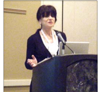
Nana giving a presentation about the CRRC library